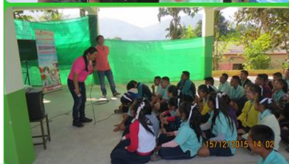
Baan Pangtonduea School, Mae Ai