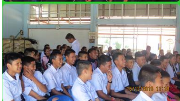
Baan Pangtonduea School, Mae Ai