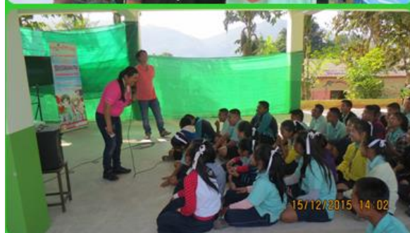
Chotikunakasem Baan Muangngam School, Tha Ton