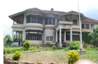
article, " Hsipaw Haw—Abode of Tragic Shan Prince "

A TV-film has been made based on the book. A recent article in The Irrawaddy magazine makes mention of the film in an