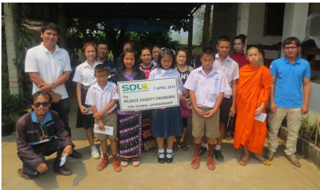
SDL Foundation have been sponsoring 12 Children for several years. The photos shows the group receiving their annual scholarship in Chiang Dao

A photo album of the scholarship children can be found by clicking on the following link; Scholarship Programme