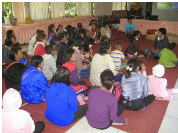
HIV patients at Chiang Dao Hospital

The Education and Prevention Programme reaches out to many diverse groups of people ; HIV patients and their families, children with HIV, schools, community gatherings targeting local youth, get-togethers of HIV healthcare workers to exchange experiences etc.