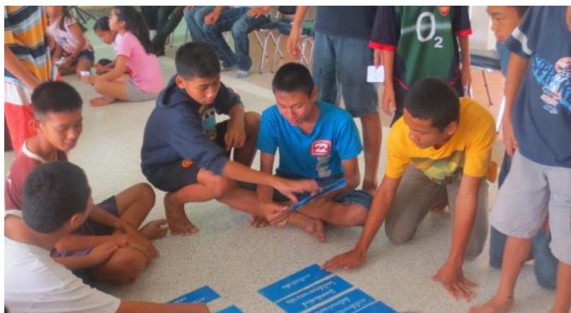
Weekend Community meeting for the youth in Sankampeang