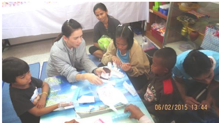
Children learn the importance of taking their medicine