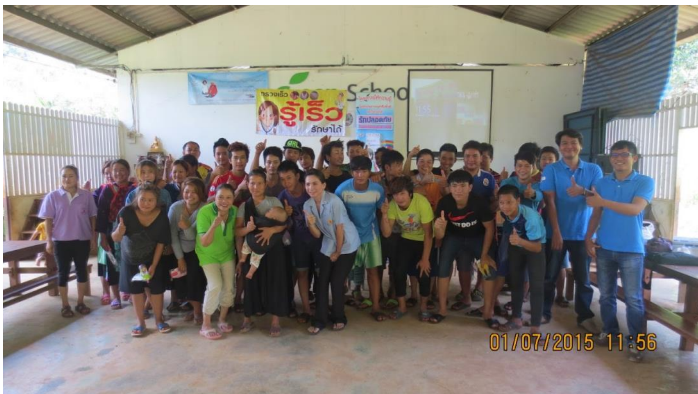
Lisu hill tribe youths at Nong Khaem School